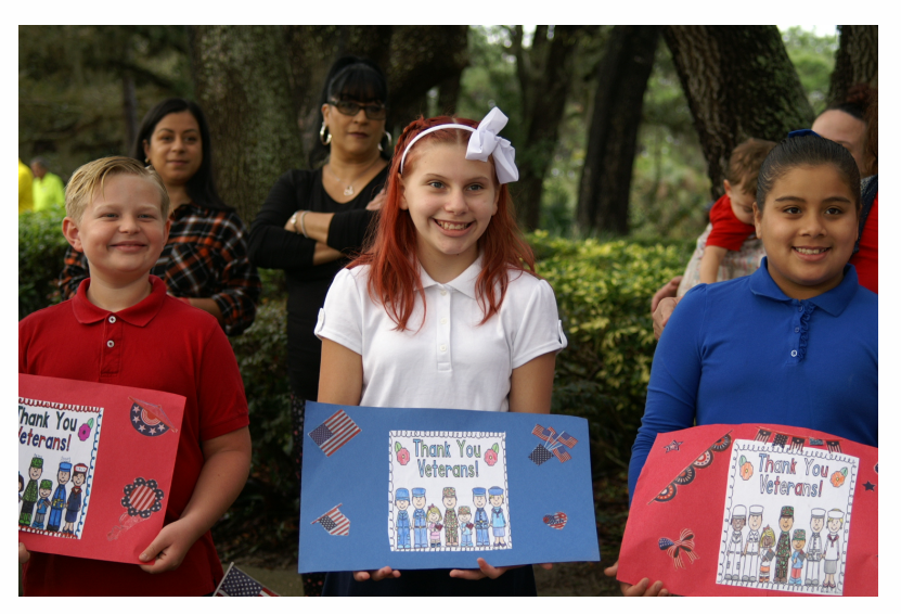
GLVFA Veterans Day Golf Event: A Community Affair!

As a SPONSOR . your business is front and center at the event. Local and state officials along with veteran organizations, players, and event volunteers provide exposure and interaction for your business throughout the event and post-event activities including event lunch and and presentations.