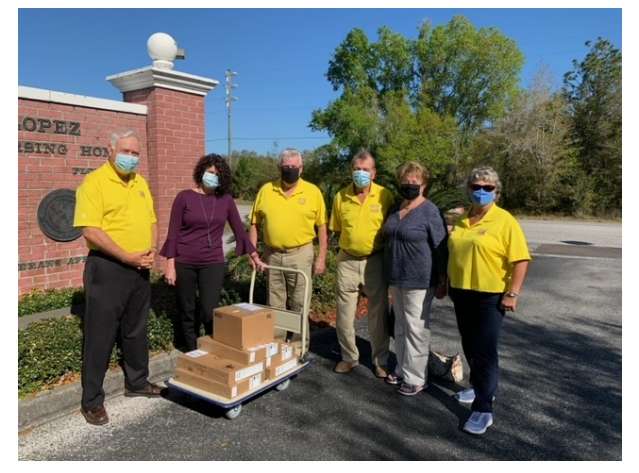
New computers for Florida State Veteran Home